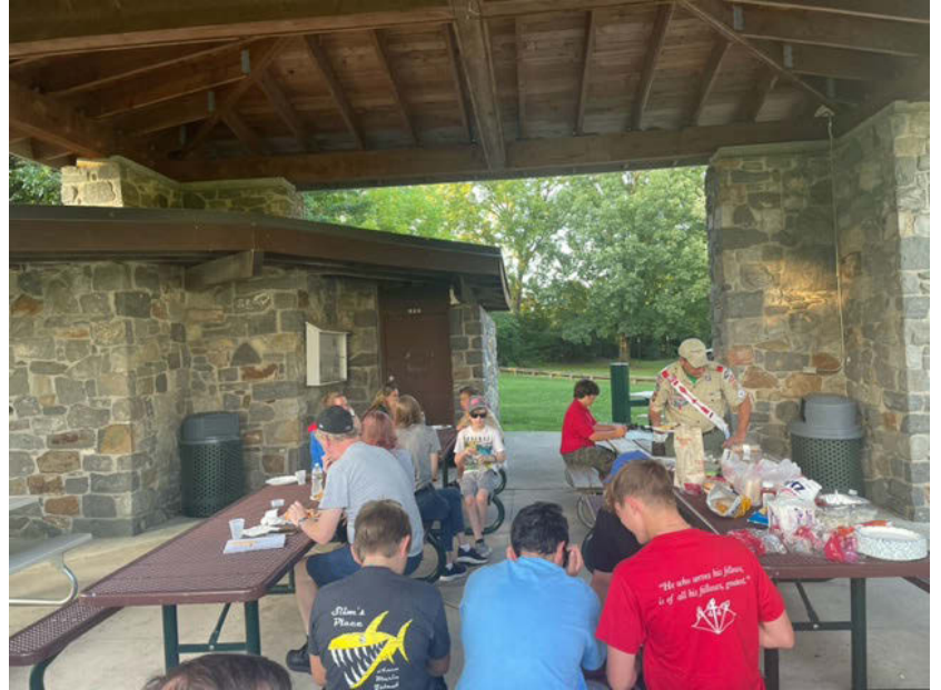
Pictures from the Takhone Chapter picnic on August 15, at Louise Moore Park.